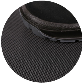
G1300 Fine Ribbed Mat black